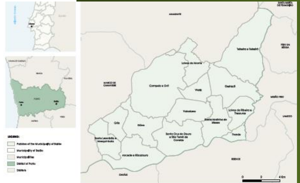
Fig. 1 - Baião: Location in Portugal, Porto District and administrative organization

The landscape of Baião is today the result of a distinctive structure as the man occupied and transformed into a territory over thousands of years, resulting in a landscape of great cultural value, with a strong historical heritage. The oldest occupation of this territory is concentrated in the central plateaus of the Aboboreira and Castelo mountain ranges and dates back to the most recent prehistory that spans a long chronological period of four thousand years and includes different traces. Noteworthy is the national monument "Chã da Parada I", built between the 1 st and 2 nd half of the 4 th millennium BC, this prehistoric funerary monument still has engravings inside. But the territory is full of landmarks from several historical periods, from the Romans to the Baroque or the Pre-industrial period.