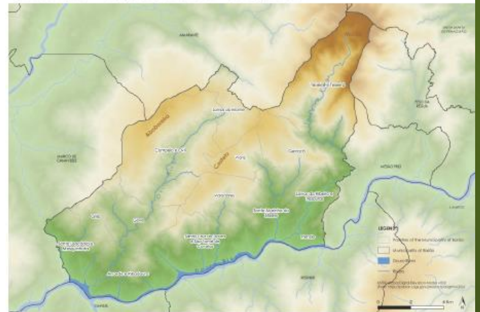
Fig. 2 - Baião: Physical Features